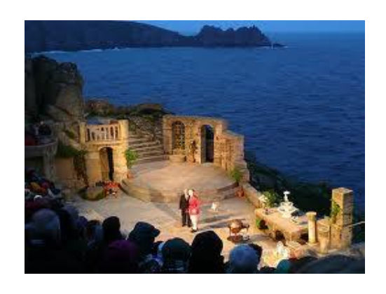
The Minack Theatre - above St Michael's Mount - left

The Roseland Pensinsular is wonderful and you can take the King Harry Car Ferry (20 minutes) from Feock to explore Portscatho, St Mawes and St Just in Roseland or drive to Falmouth and take the foot ferry to St Mawes;